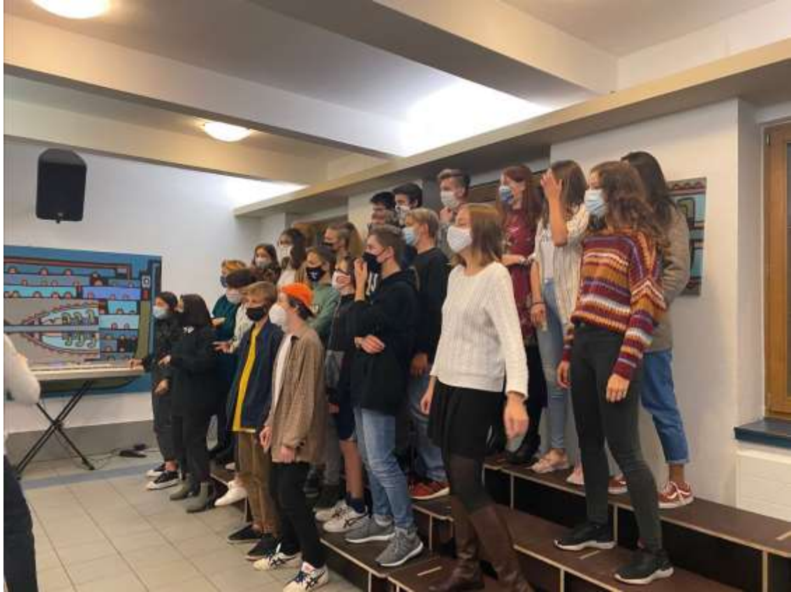
Prayer Requests and Praises: