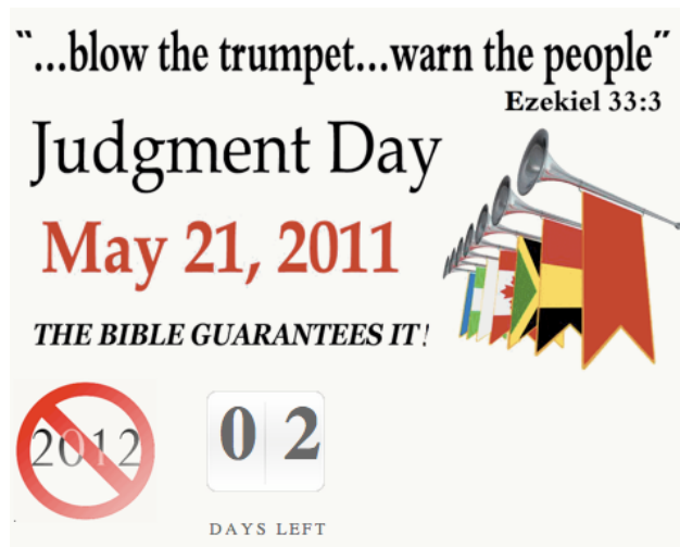
Screenshot - Thursday, May 19, 2011 at 9:34 a.m.